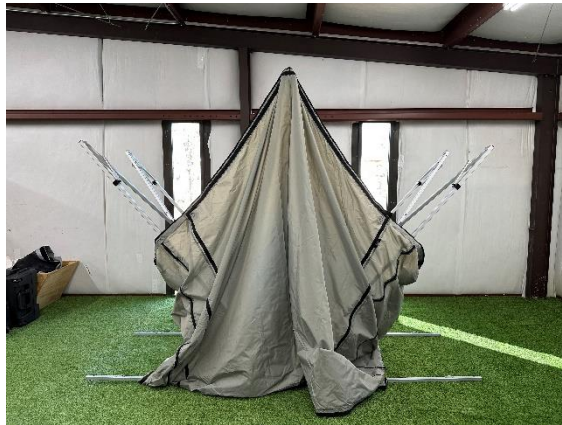
Figure 3.5 Attach the Cover Peaks