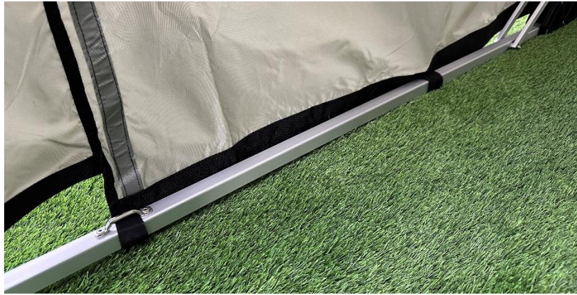
Figure 0 Secure the Bottom