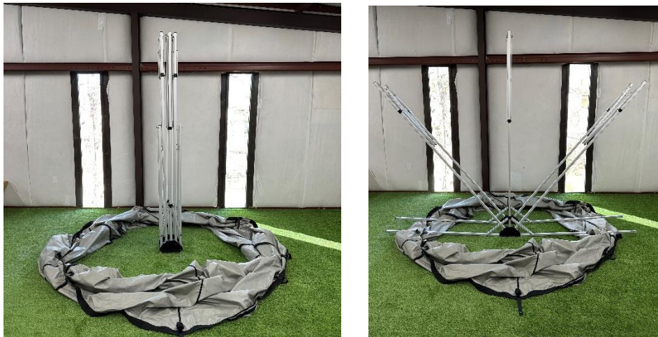
Figure 3.3 Place the Frame