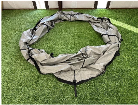
Figure 3.2 Layout the Cover