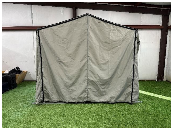
Figure 3.6 Attach the Cover Corners