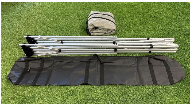
Figure 2 Required Components