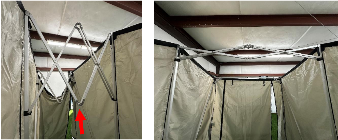
Figure 3.7 Expand the Frame