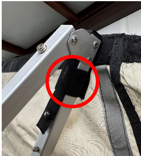
Figure 3.9 Fasten the One-Wrap