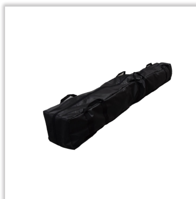
DUFFEL BAG #4203