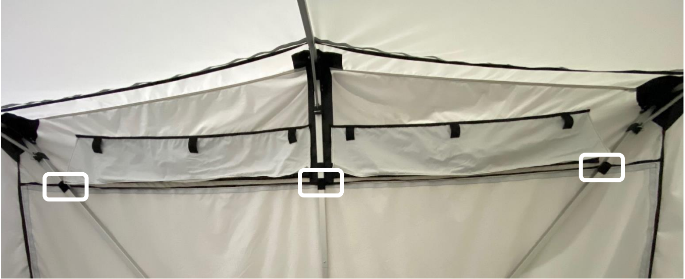
Figure 3.4 Hook Fastener Locations

3.4. Repeat step 3.3 for the diagonal supports.