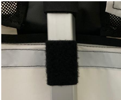
Figure 3.3 Attach the Hook Fastener