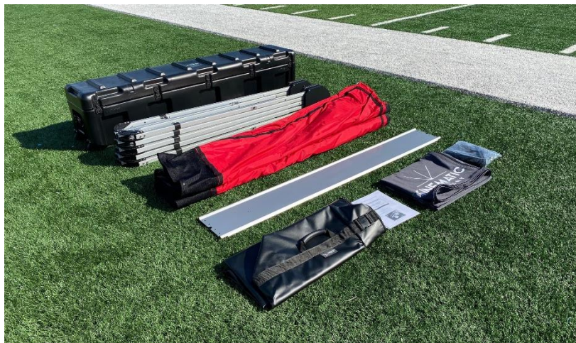
Figure 2 Required Components