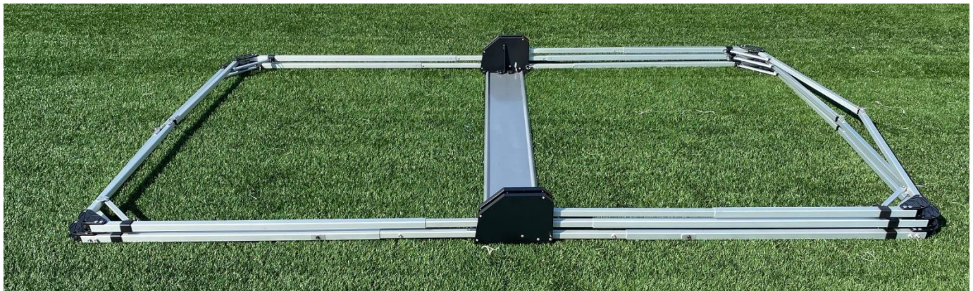
Figure 3.6 Install the Crossmember

3.6. Place the crossmember between the hubs and connect it using the four knobs removed in Step 3.2.