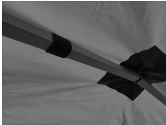
Figure 4.5 Attach the Cover

4.6. Attach the cover to the vertical support using the one-wrap Velcro located just above the truss lock.