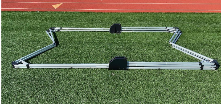
Figure 7.11 Cover Removed

7.12. Return SidelinER to a modified ready position.