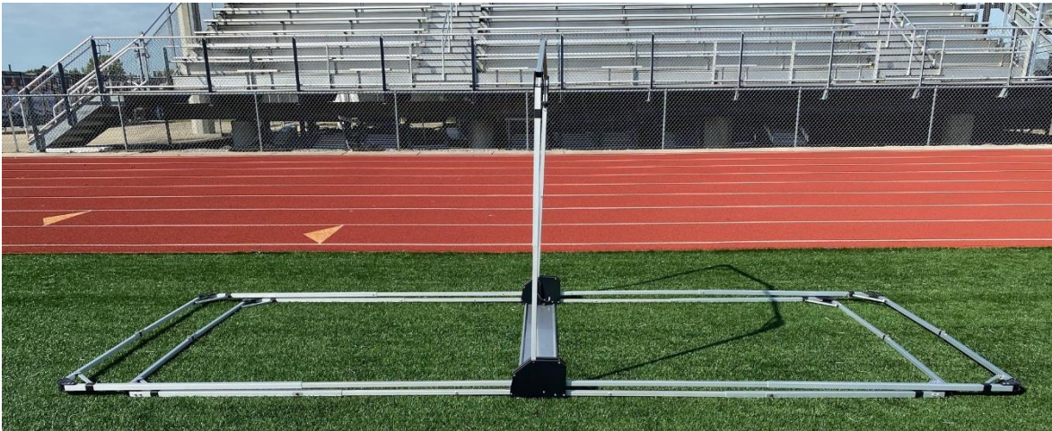
Figure 3.8 Extend the Frame