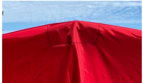
Figure 4.2 Place the Cover on the Frame