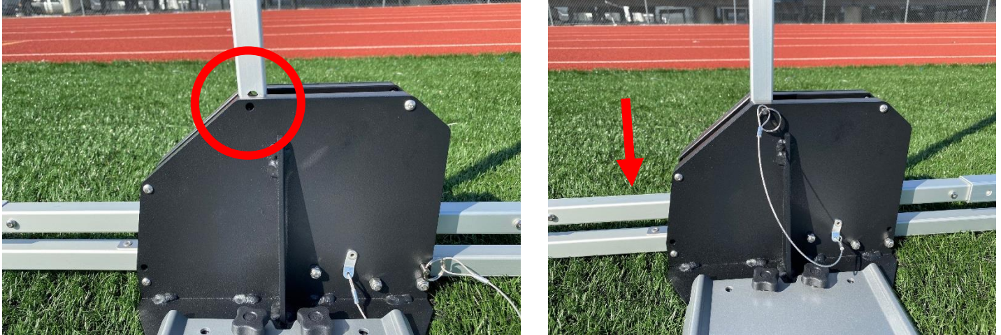
Figure 3.7 Raise the Center Support