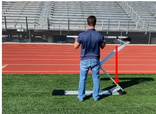
Figure 7.13 Folding the Frame

7.13. Lift one side up and lower it down until the hubs come together. Pass the threaded studs of one hub through the holes in the other hub.