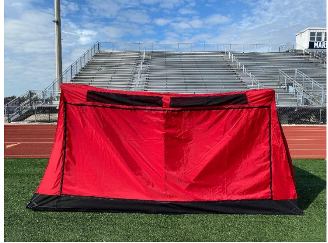
Figure 4.4 Snap the Bottom

4.5. Moving inside your SidelinER PRO, attach the cover to the overhead center support using the one-wrap Velcro located on the left and right of the peak.