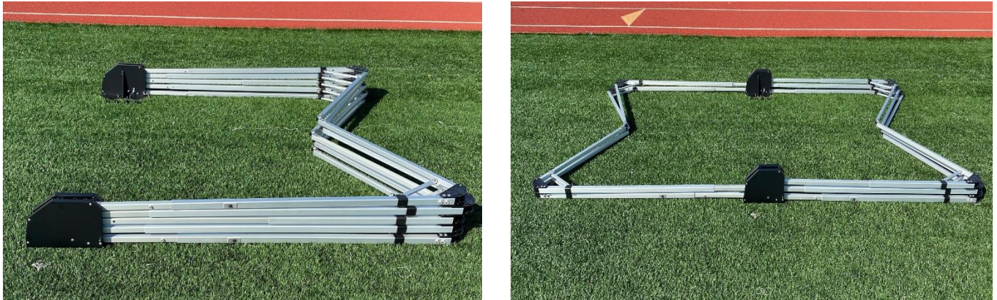
Figure 3.4 Open the Frame

3.4. Lay the frame on the ground and rotate the top two frame sections over to the opposite side.