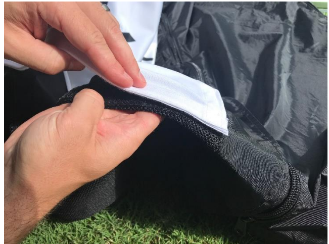
Figure 5 Attach the Branding