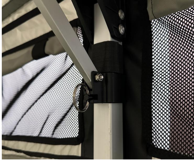
Figure 7.5.1 Disengage Truss System

7.5.1. Pull and turn the ring on each slider so it remains disengaged.