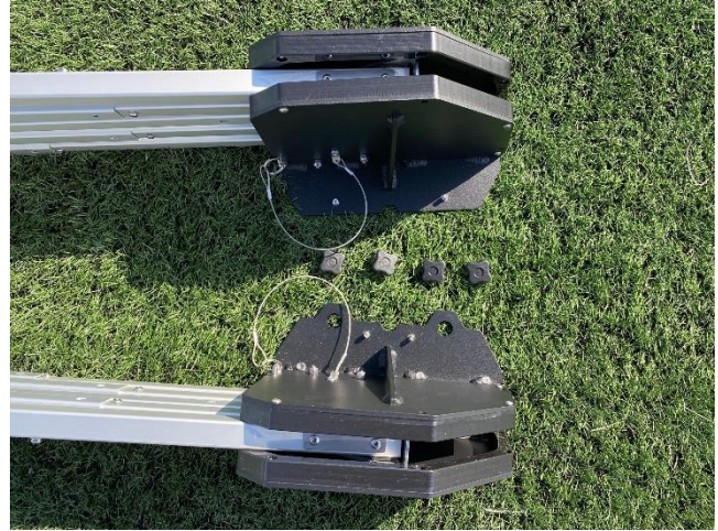
Figure 3.2 Separate the Hubs