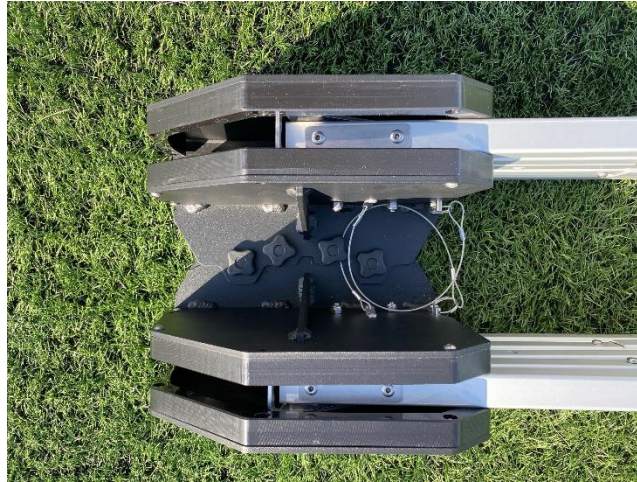
Figure 7.14 Knob Installation