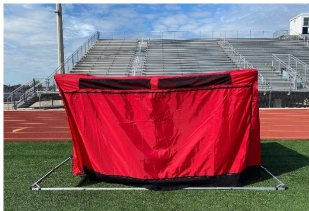
Figure 4.3 Place the Diagonal Supports