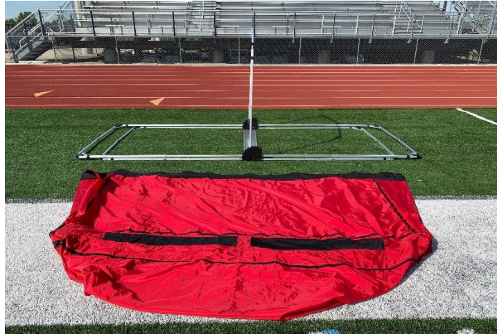
Figure 4.1 Unfold the Cover