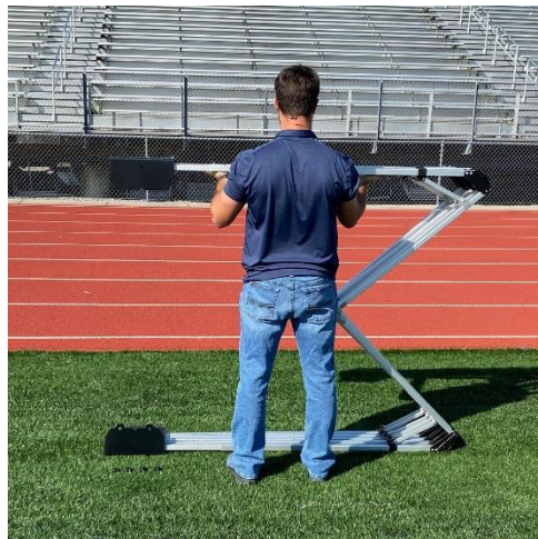
Figure 3.3 Separate the Sides