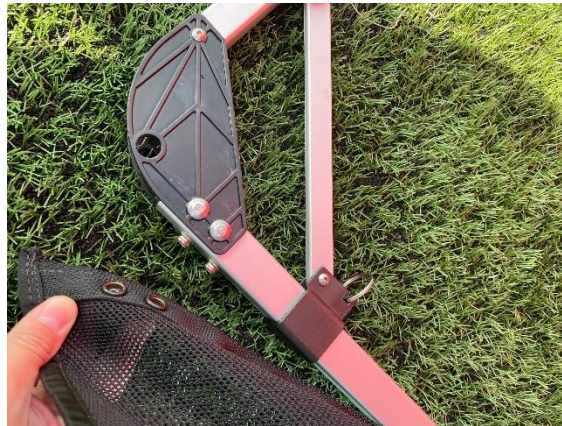
Figure 7.10 Unfasten the Horizontal Tube Snaps

7.10. Unfasten the 16 snaps (four per tube) found on the horizontal tubes that touch the ground.