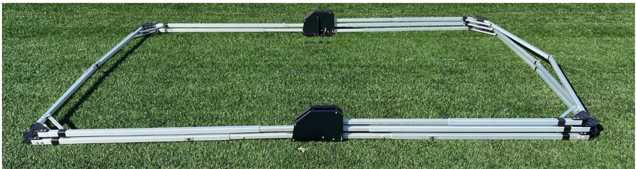
Figure 3.5 Lock the Truss System

3.5. Push outward on all five upper sections until the truss system locks in place. There are 10 sliders that need to be locked. Do not extend the supports into their locked position at this time.