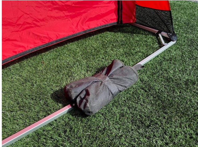
Figure 6.3 Sandbag Placement