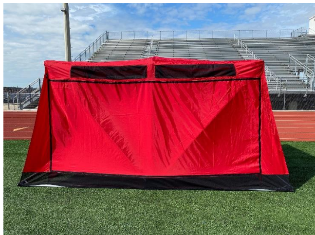
Figure 7.2 Fully Expanded