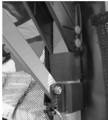
Figure Error! Reference source not found. Attach the Cover to the Vertical Supports