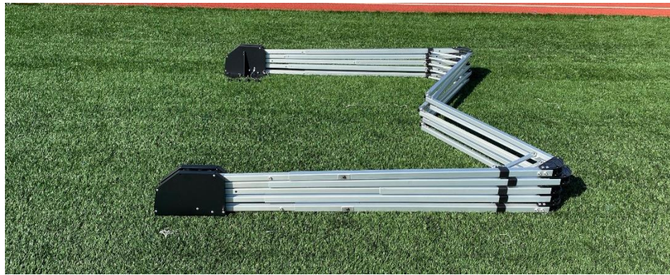
Figure 7.12 Modified Ready Position

7.12. Return SidelinER to a modified ready position.